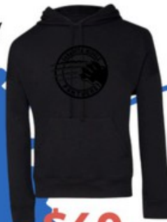
UNISEX HOODED SWEATSHIRT