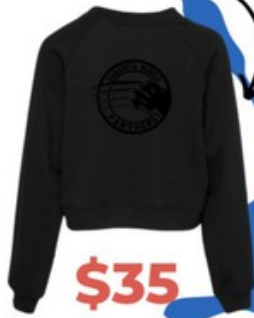
WOMEN'S CROPPED SWEATSHIRT